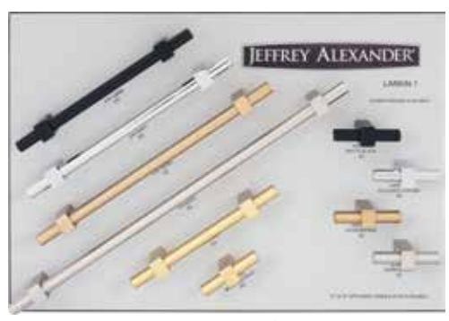
DB821-GRY (Larkin 1)