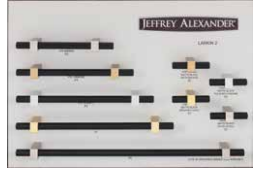
DB822-GRY (Larkin 2)